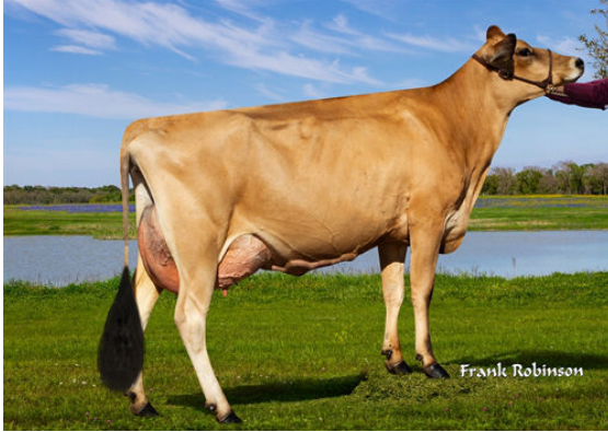
JX LUCKY HILL WILDFLOWER {6} GRANDDAM

JOHNNYCASH-P x JX CLEARCUT{3} x BALTAZAR {5}