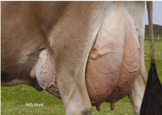
LUCKY HILL JOKER WABORITA FOURTH DAM