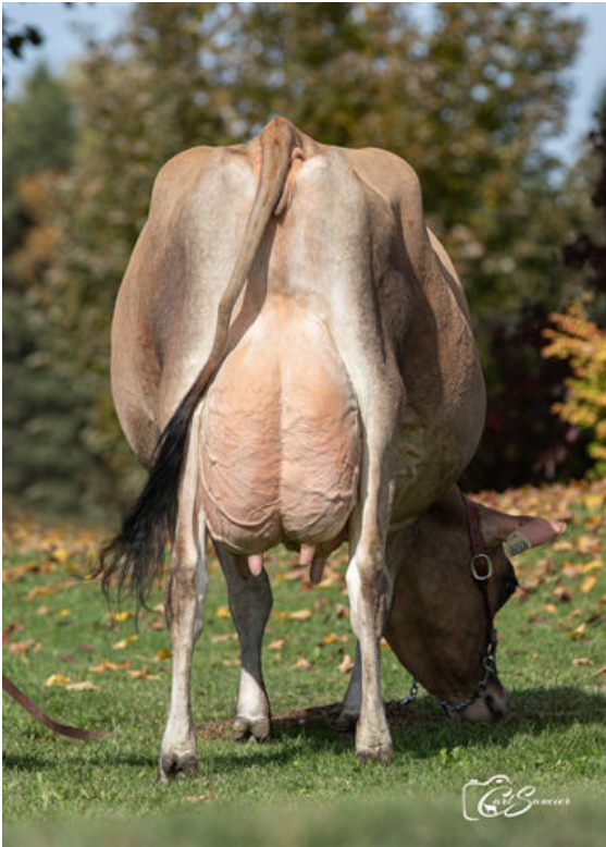
LENCREST PREMIER FARREN