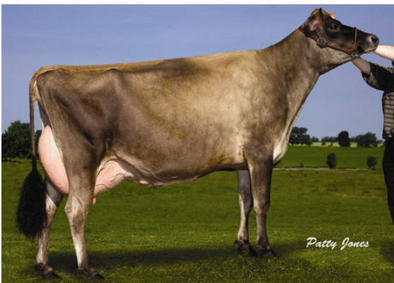
HAUTPRE SULTAN FAME