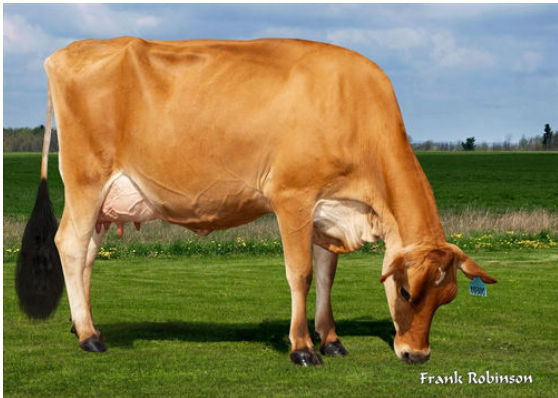
JX VIERRA PRESLEY {6} DAM