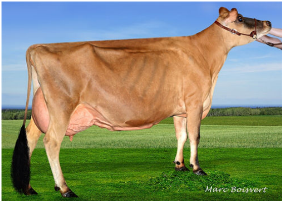
DORLYN JETE-STREAM MIEL GRANDDAM