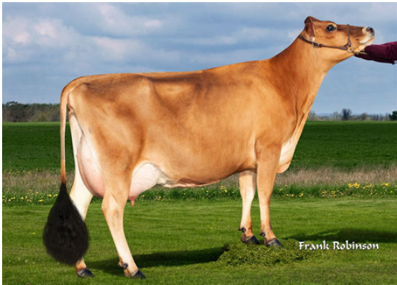
AHLEM SPIRAL GENEVEVE 62392 DAUGHTER