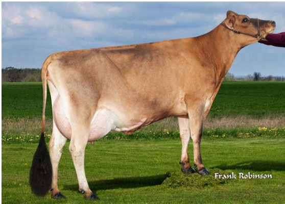
JX AHLEM SPIRAL ANORA 62476 {5} DAUGHTER