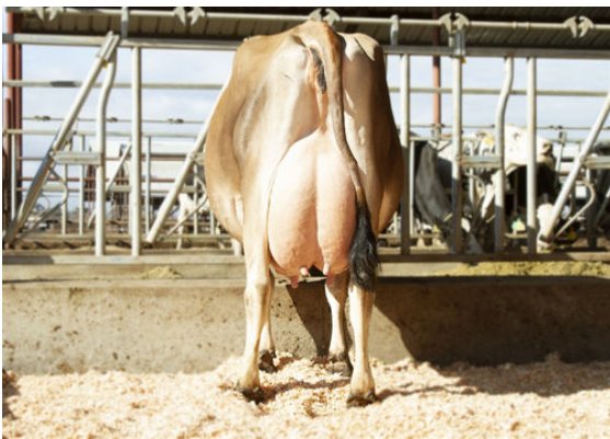
SHJ LISTOWEL MACKENZIE