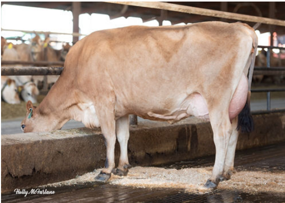
JX PROGENESIS MINNIE {5} DAUGHTER