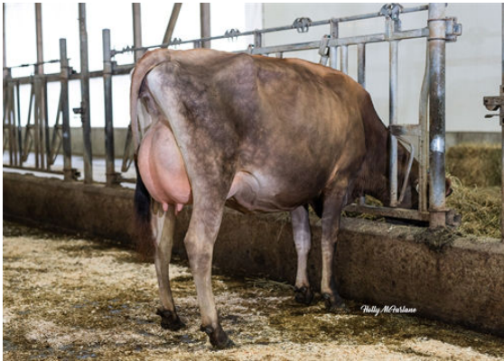
BRIDON J VISION