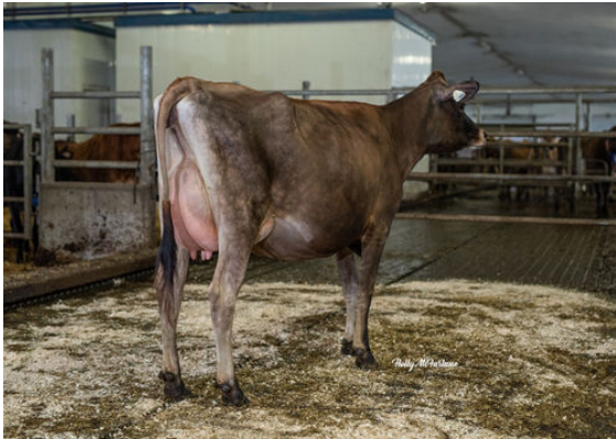
BRIDON J VISION