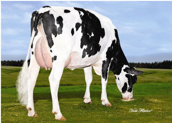
BRECLENE EXCITE VICKS