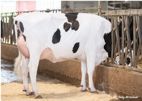
SANDY-VALLEY BORN2BOOGIE DAM