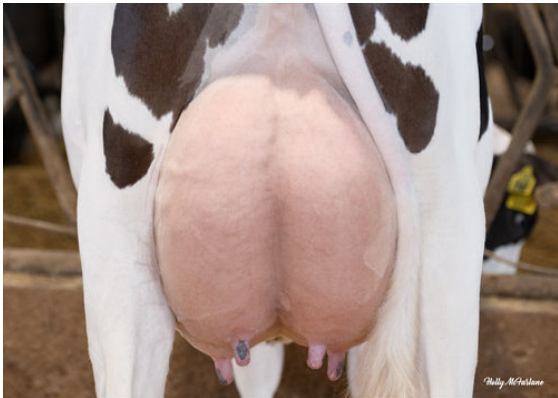
SANDY-VALLEY BORN2BOOGIE DAM