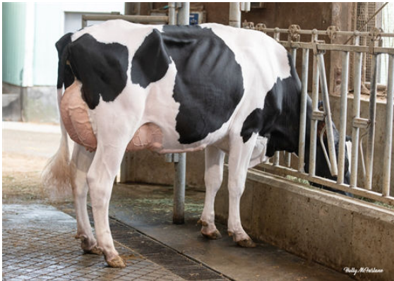
PROGENESIS MAGNIFIQUE PROUD DAM