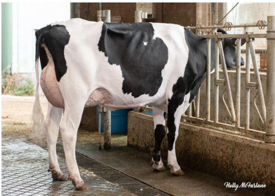
PROGENESIS ZAZZLE PRESTIGE GRANDDAM