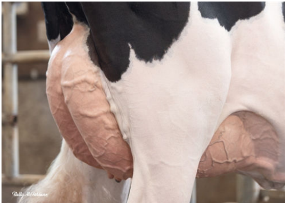
PROGENESIS MAGNIFIQUE PROUD DAM