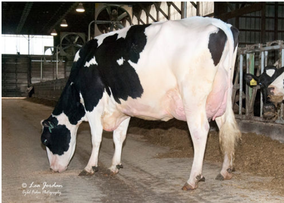
OCD DELTA 33343 FIFTH DAM