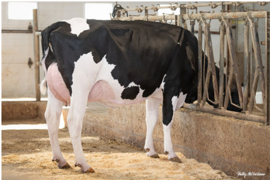
PROGENESIS GRAZIANO JAZMATIC DAM