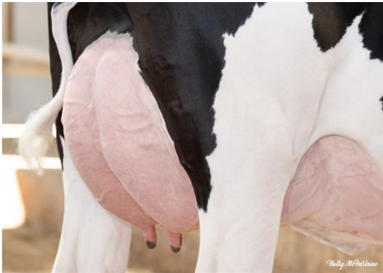
PROGENESIS GRAZIANO JAZMATIC DAM