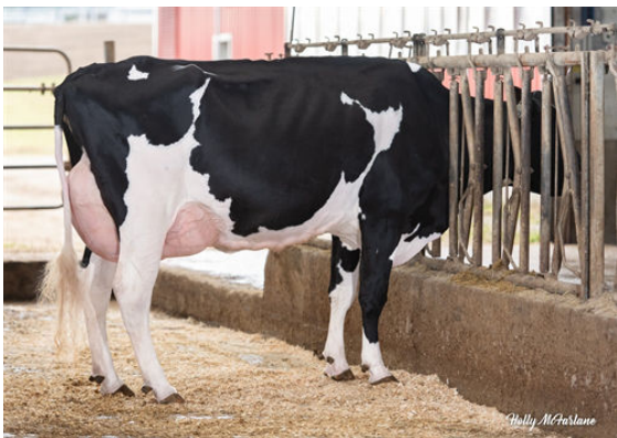
PROGENESIS TORRO JAZZHANDS GRANDDAM