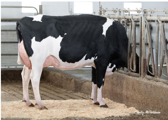
PROGENESIS ZAZZLE PAPRIKA GRANDDAM