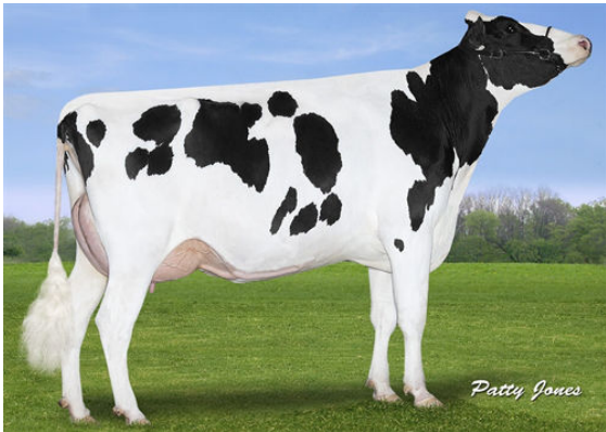
MS-FARNEAR-MICA-MARGARITA- FOURTH DAM