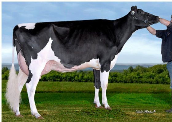
FEPRO PERFECT LINDOR