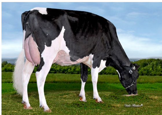
FEPRO PERFECT LINDOR