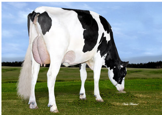
BLONDIN TJR BOMBERO MAPLE