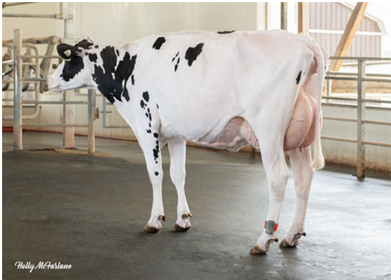
LARENWOOD ALLIGATO CRAZY 1114 DAM