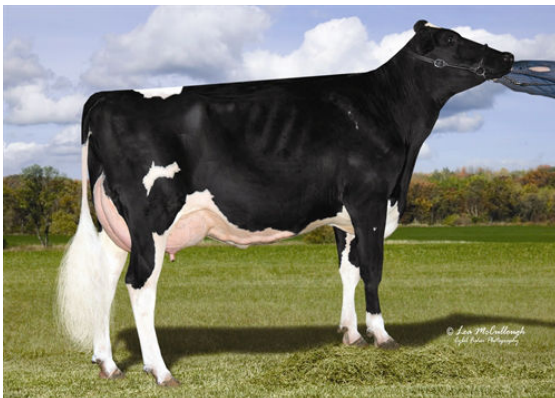
COOKIECUTTER MOM HALO FIFTH DAM