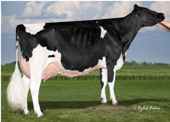
COOKIECUTTER MOG HANKER FOURTH DAM