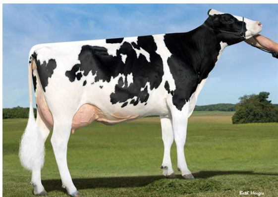
SANDY-VALLEY MORGAN ERA FOURTH DAM