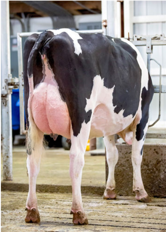
SANDY-VALLEY G ESCAPADE DAM