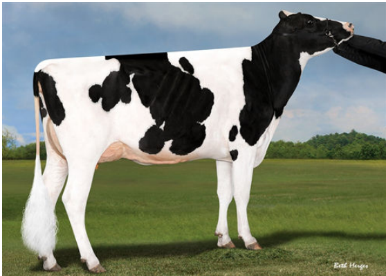
SYNERGY RUBICON PERFECT FOURTH DAM