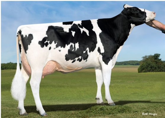
SANDY-VALLEY MORGAN ERA FOURTH DAM