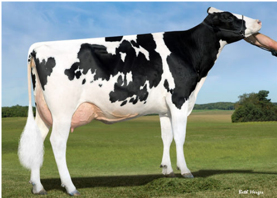
SANDY-VALLEY MORGAN ERA FOURTH DAM