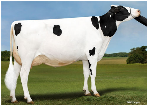
SANDY-VALLEY EVERYREASON GRANDDAM