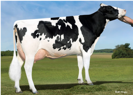
SANDY-VALLEY MORGAN ERA FIFTH DAM