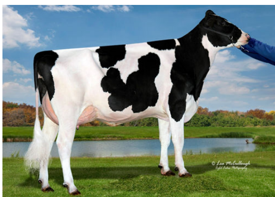
OCD DOORMAN 9689 FOURTH DAM