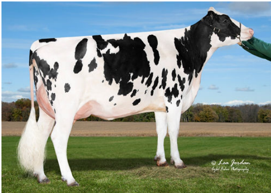
LA-CA-DE-LE CRIMSON MONA GRANDDAM