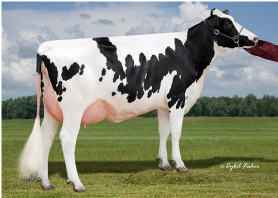
LA-CA-DE-LE CW MONA 8772 DAM