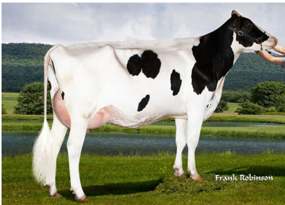
CHERRYPCOL LEE THIRD DAM