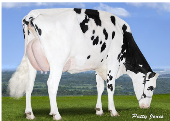
PEAK BOMBERO MAXIMA FIFTH DAM