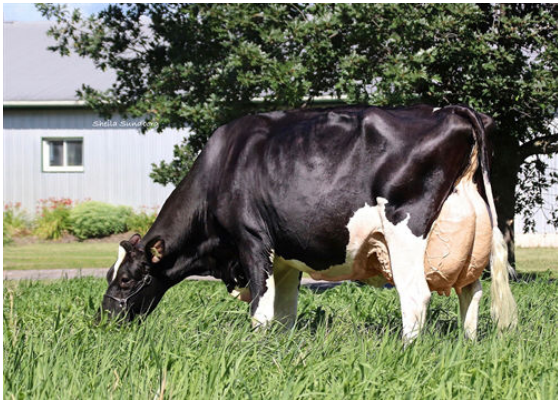
MYSTIQUE EXTREME ABRICOT GRANDDAM