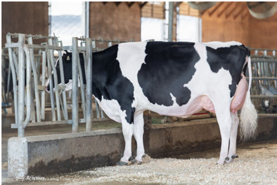
MYSTIQUE LAMBDA ANIS DAM