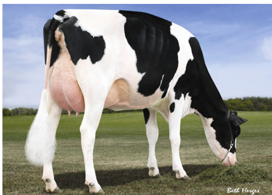
MORSAN MAN D MISSY FIFTH DAM