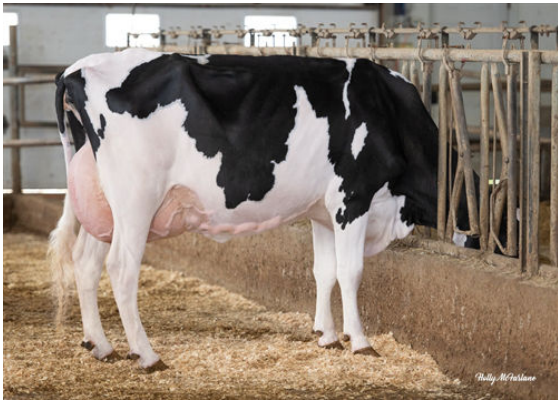
PROGENESIS ZAZZLE TWIGGY DAM