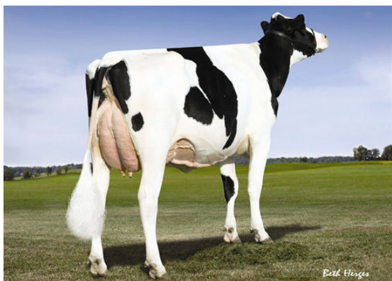
LADYS-MANOR DORCY ODA THIRD DAM