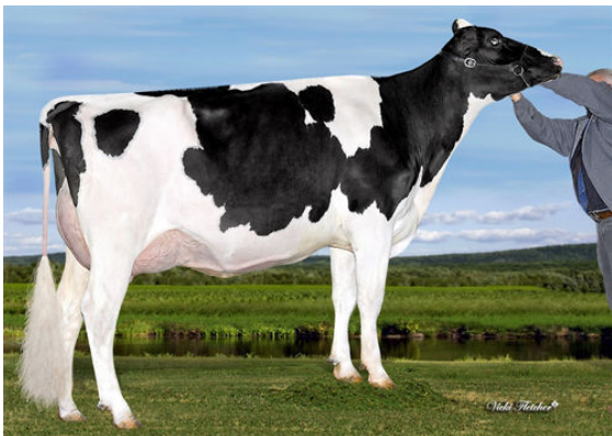
COMESTAR LATASHA TROPIC DAM