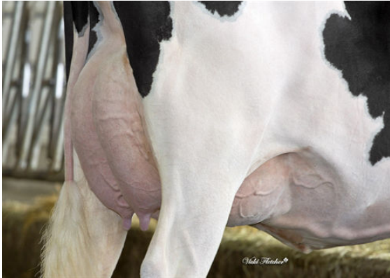
COMESTAR LATASHA TROPIC DAM