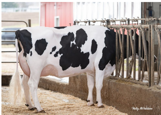
COOKIECUTTER A HOMILY