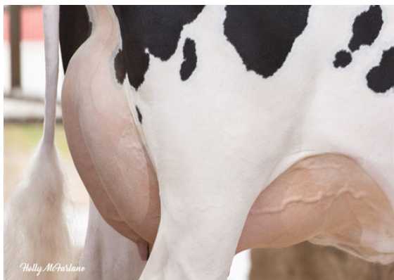
COOKIECUTTER A HOMILY