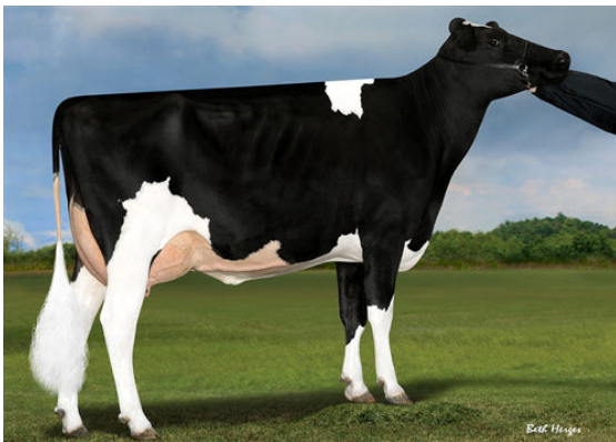
IHG LOTTOMAX TANIA FOURTH DAM