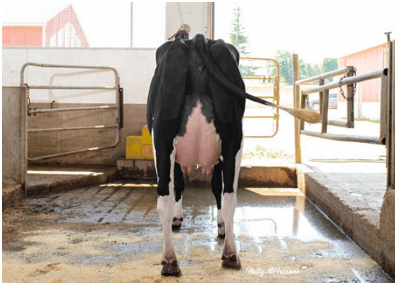
PROGENESIS CHARLEY TULIP THIRD DAM