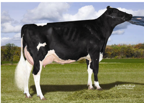
COOKIECUTTER MOM HALO FIFTH DAM