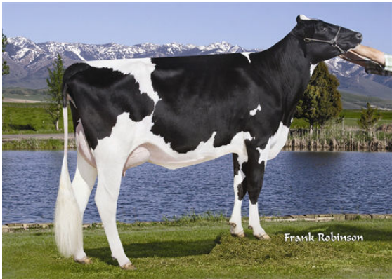
T-C-G OBSERVER MAY FIFTH DAM