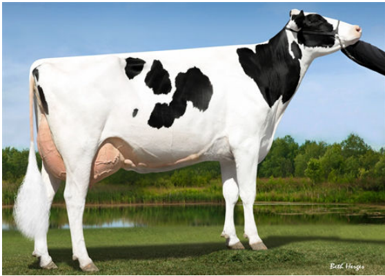
SEAGULL-BAY MOGUL 1725 FOURTH DAM