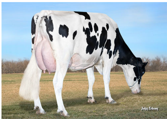
S-S-I BOOKEM MODESTO 7269 FIFTH DAM