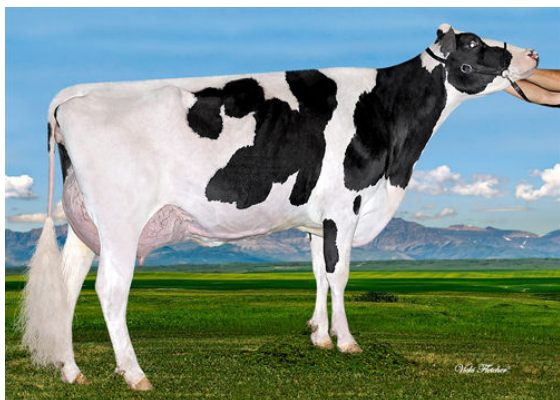
MS SOFIAS DELTA SKY FOURTH DAM