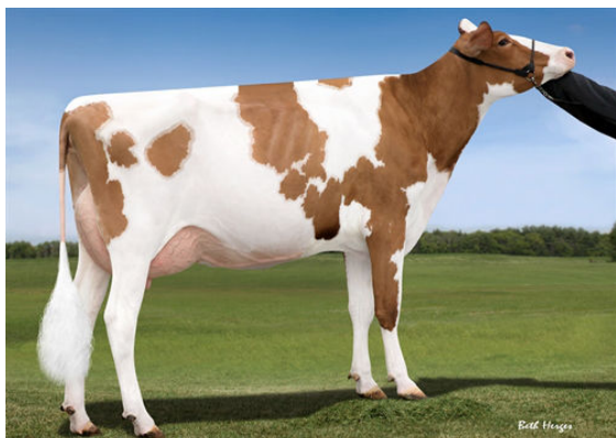
SNOWBIZ SYMPATICO SOFIA FIFTH DAM