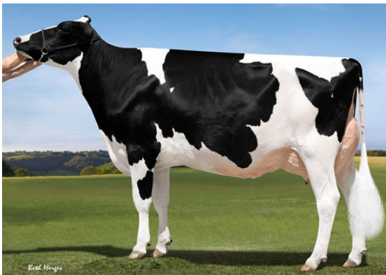
OUR-FAVORITE UNLIMITED FOURTH DAM