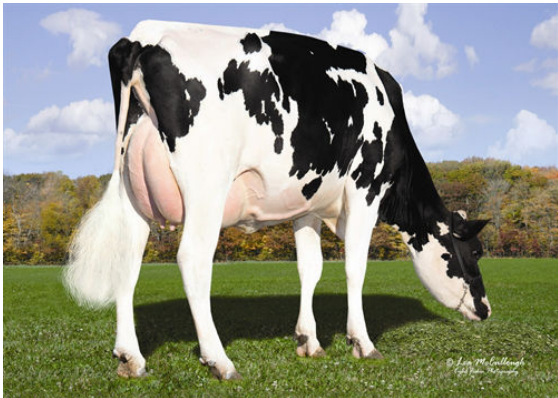
OCD MAN-O-MAN FANTOM FIFTH DAM