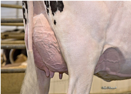
DICKLANDS KING DOC 3503 DAM