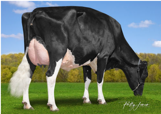
HANALEE IMPRESSION AUDI DAM