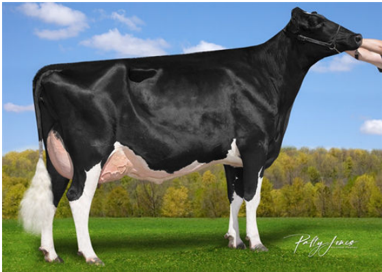
HANALEE IMPRESSION AUDI DAM