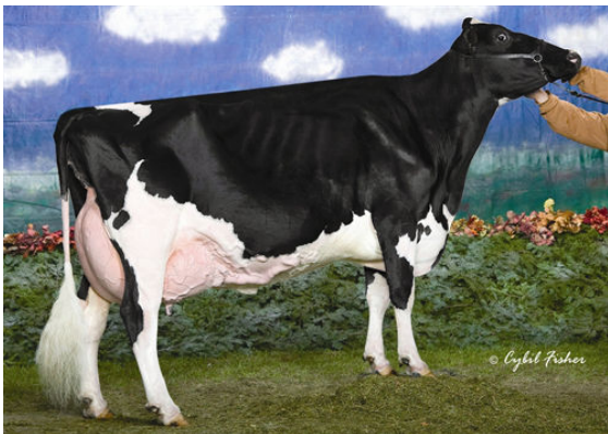
AMLAIIRD LEE ALICE FIFTH DAM