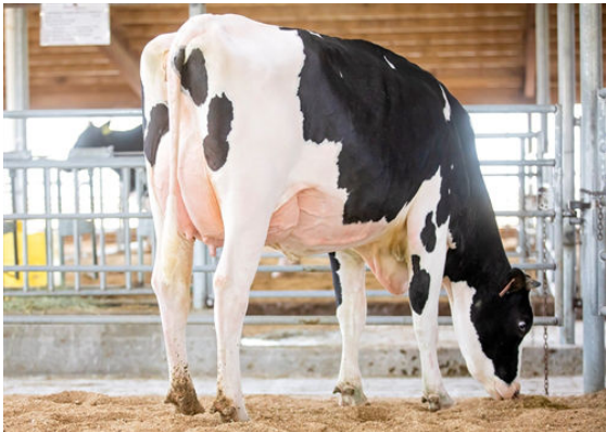
WINSTAR CLARITY 5610 DAM