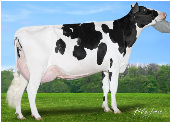
MORNINGVIEW DUKE ZIP GRANDDAM