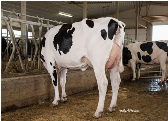
PROGENESIS TOPNOTCH BRAVE GRANDDAM