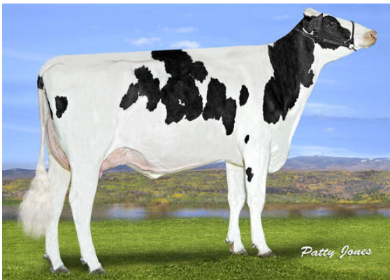
PROGENESIS MONTANA BEAUVAIS THIRD DAM