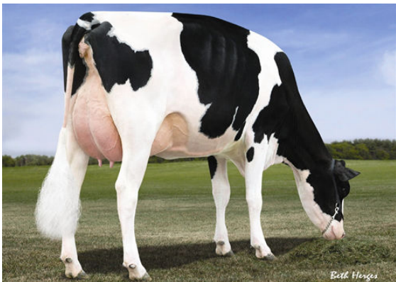
MORSAN MAN D MISSY FOURTH DAM