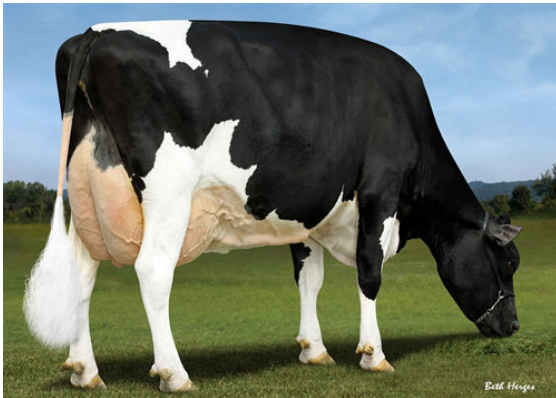
MISTY-MOOR DELTA PAILOU FOURTH DAM